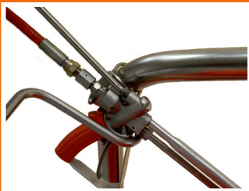
Stainless steel top-frame with gun rest / lance holder.