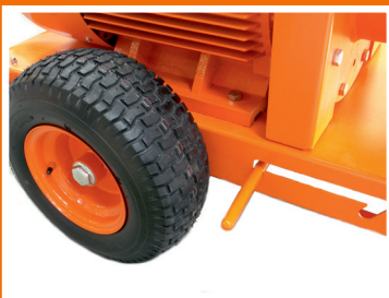
Galvanized frame with built in brake and pneumatic wheels.