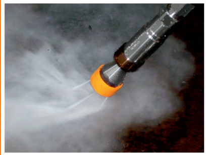
Ultra Impact Rotating Nozzle