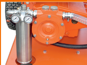
Integrated booster pump & filter system.