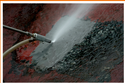
Surface - Sand Blasting