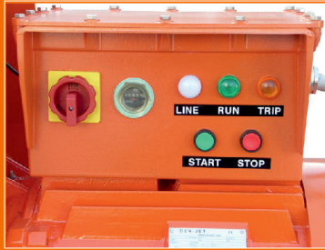
Die cast electrical box with main switch, overload relay & hour meter.