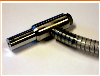
Sand Blasting Equipment