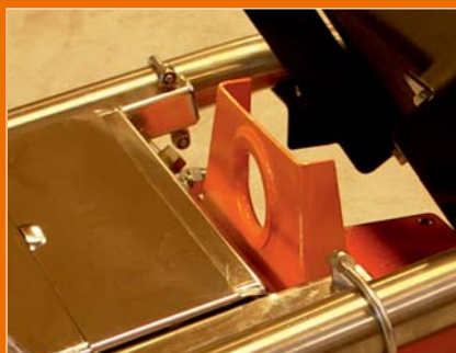
One centralized and balanced lifting eye.