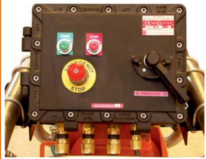
Cast electrical Ex box with main switch, star delta starter and overload relay.