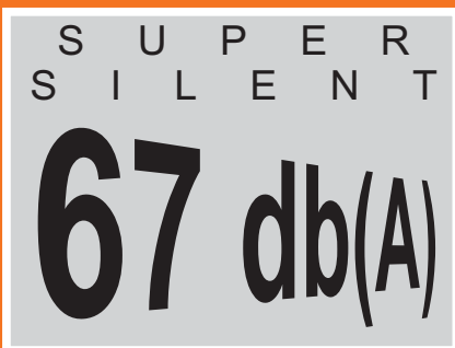
Sound silenced canopy.