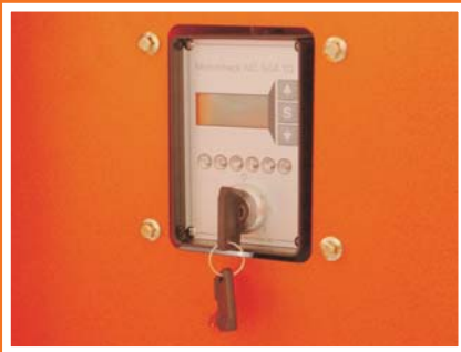
Electronically controlled engine.