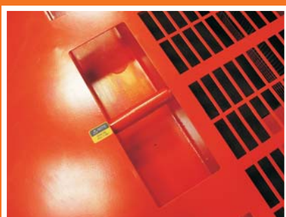
One centralized and balanced lifting eye.