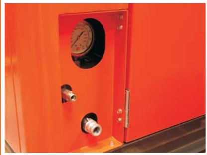
Bulkhead inlet and outlet positioned on front panel.