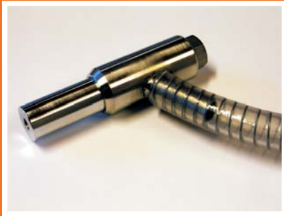
Wet Sand Blasting