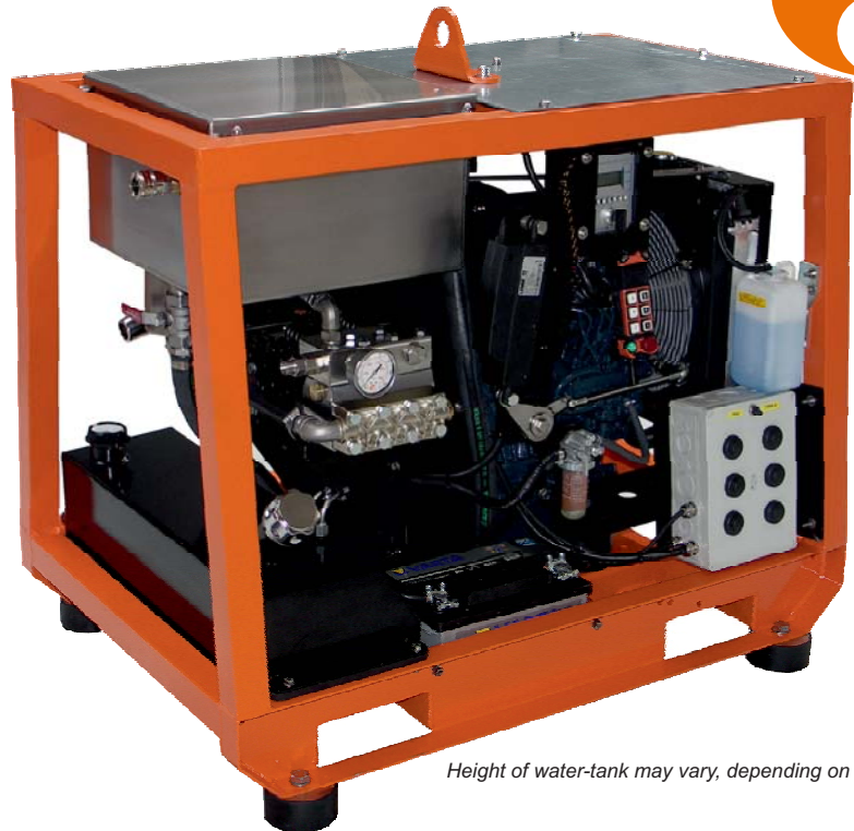
Height of water-tank may vary, depending on model