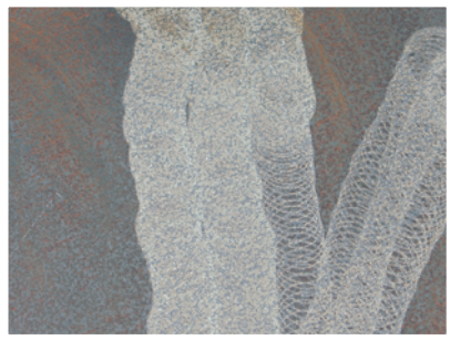
Water Blasting With Rotating Nozzles.