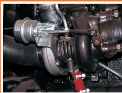
4 Cyl. Turbocharged Engine