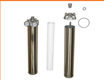
Strainers & Filtration.