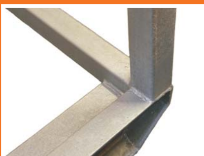
Hot Dip Galvanized Frame