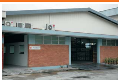
DEN-JET Factory Singapore