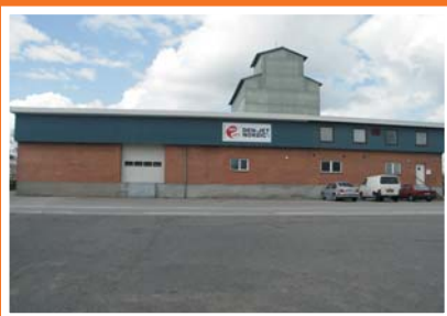
DEN-JET Factory Denmark