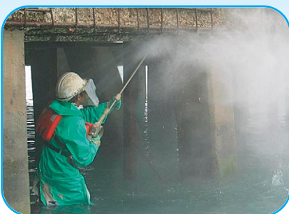
Concrete cutting - 59lpm / 1000 bar