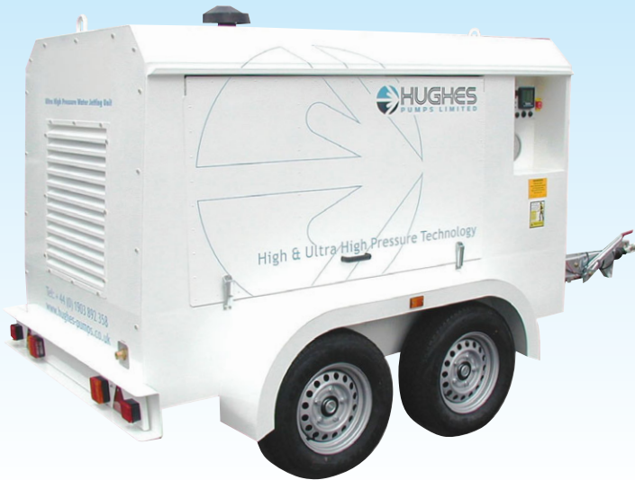
HPS2200 Diesel Road Trailer