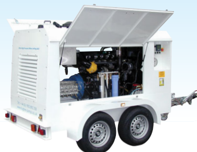
Full sized, lift-up doors for ease of access