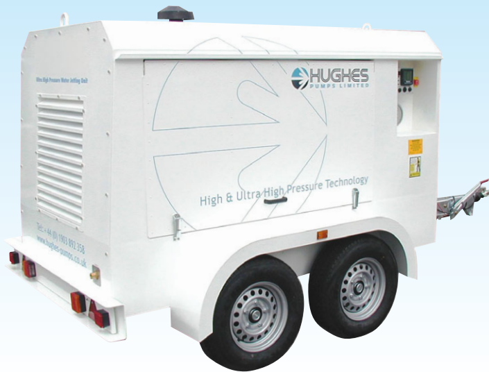
HPS1000 Diesel Road Trailer