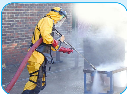
De-scaling - 28lpm / 1400 bar